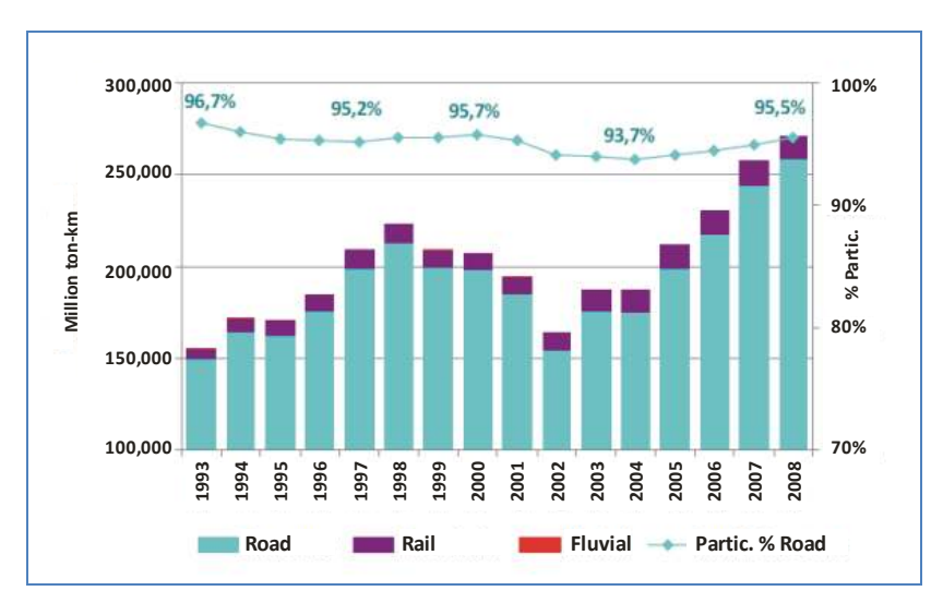
Figure 1 Distribution of interurban cargo transportation in Argentina.

This situation led to an empowerment of workers and employees of the automotor transport loads sector, who obtained the highest increase in real wages over the last decade: 122% (Ministerio de Trabajo, Empleo y Seguridad Social, 2014).