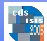
Bibliographic formats of participant libraries

II World Congress of CDS/ISIS Users Salvador - Bahia 20-23 september 2005