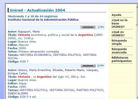
Example of searched record