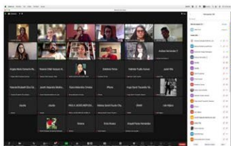
Third Collaborator Symposium: Dialogues between Composers, March 2023