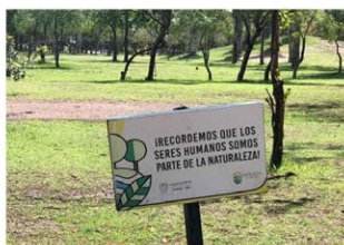
"Let's remember that human beings are part of nature!" Parque Rodolfo Landeros, Aguascalientes, México. julio 2022