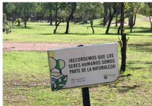
"Let's remember that human beings are part of nature!" Parque Rodolfo Landeros, Aguascalientes, México. Photo: Carbajal-Vaca, julio 2022