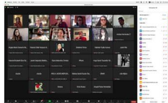
Third Collaborator Symposium: Dialogues between Composers, March 2023