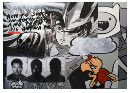
Marcos Arias, La resurrección de Lázaro , 2017. Oil and acrylic on canvas, six light boxes. 100 x 750 cm

pedagogy) entails a precise way of collectivizing discontent.