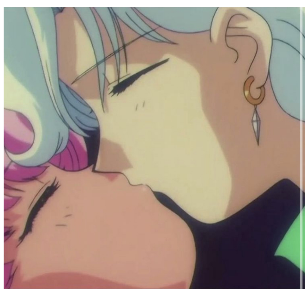
Naoko Takeuchi, Sailor Moon (Bishojo Senshi Sera Mun): Helios & Chibusa kissing scene, 1991

humans, animals, non-humans, aliens, robots, tentacled beings, and gods, anomalous and liminal beings. It is about Japanese animated production, the comic strips and manga that were a whole generation's passcode to sex-gender difference and an anti-normative world, long before the massification of the internet (and queer theory and post-porn), sniffing around among malleable identities (as in the Ranma ½ series or Cardcaptor Sakura) and acceptable sexual exposure, VHS tapes played on televisions bought on credit as a result of social indebtedness.<sup>[2]</sup>