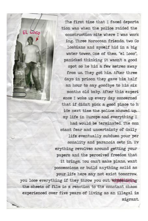
Picture #1: Spain. Crumpled paper, machine typed text, torn photograph, ink.

throw you out. <del>Vandalising</del> the sheets of film is a reaction to the constant chaos experienced over five years of living as an illegal immigrant."<sup>4</sup>