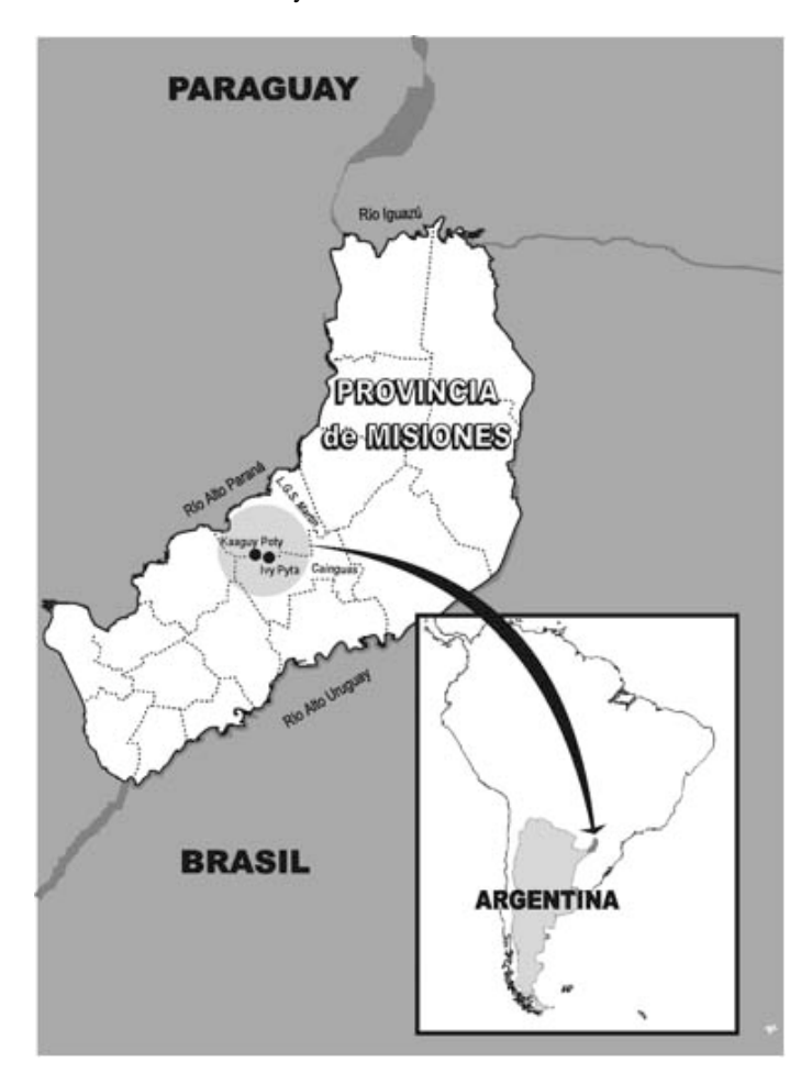
Figure 1. Mbya communities (Misiones province).

that might cause eventual harm. Once they start walking, their social interactions and mobility are widened considerably.