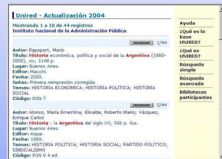
Example of searched record