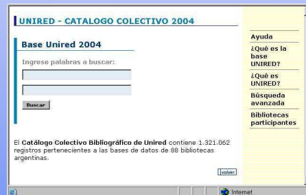
Catalog homepage http://cib.cponline.org.ar/unired.htm