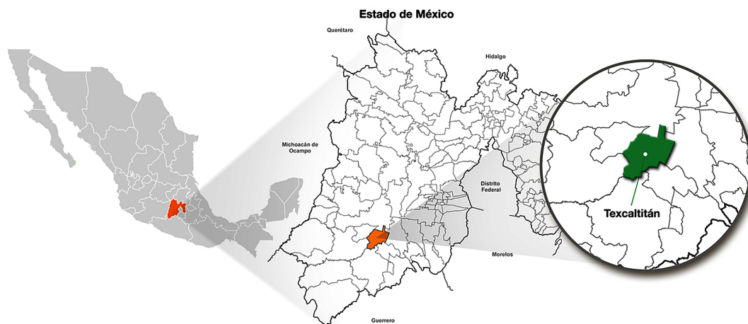
Figure 2. Map: mycological tourism paths in Texcaltitlán, State of Mexico