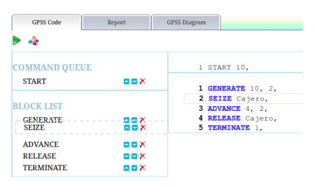
Fig. 4: Drag and Drop over the block list

have sent it to be run in the background and at the end it will output the same kind of results as any model created by hand.