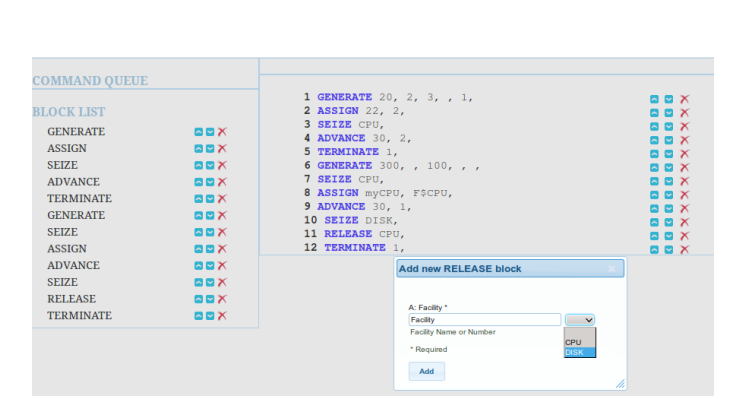
Fig. 2: GPSS ILE: dialogues display entities lists and field hints

can also be selected individually, which results in a specific report for the entity itself displaying it status in each system clock and other entities being affected. Again, these entities can also be selected, allowing the user to recursively navigate through entities and simulation snapshots.