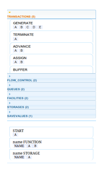
Fig. 3: Block and commands grouped by function or entity