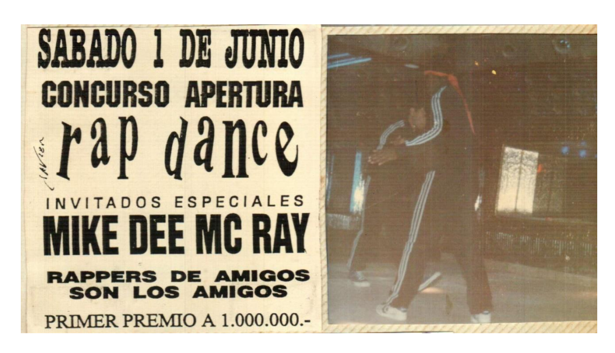
Figure 3: Flyer promoting a rap party at the Pandemonium disco in the western suburb of Laferrere, La Matanz.a