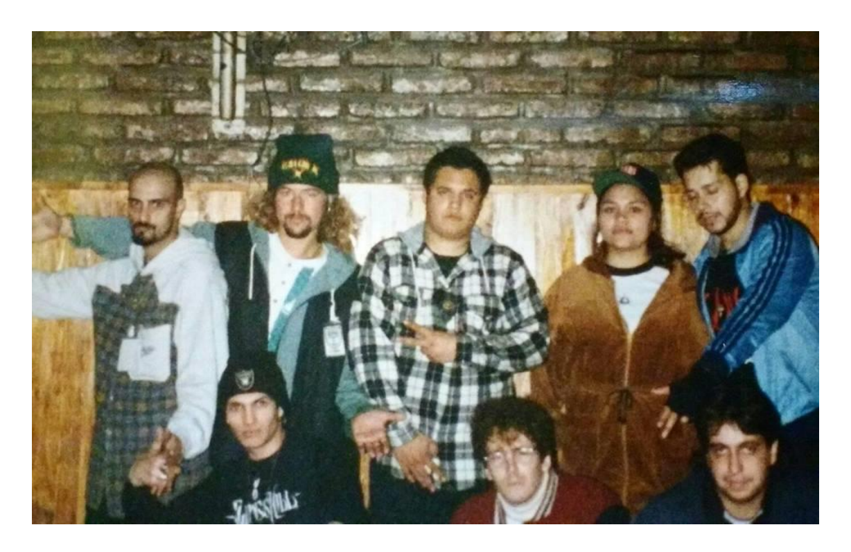
Figure 4: Breakers at an old school premises in the western BA suburb of Villa Madero, La Matanza.

The first experience allowed the emergence of several rappers (and DJs too) who later played a key role in the movement in the following decade.