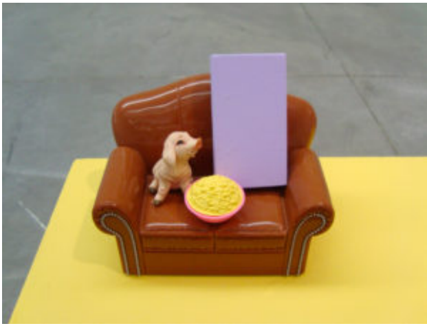
From the series Dollhouses, 2016, toys with geometric forms.

and I found the girls who sold their toys for very few euros. I had been working with the idea of the dollhouse for some time, but this was a great opportunity to use them in a concrete way. I decided in that moment to work from what I found at those fairs. The rest of the installation was completed with a series of prints on canvas, where I digitally worked from two series of handmade drawings that I titled Geo Sci Fi Cyborg . It seemed to me that I could conjugate two-dimensionality and objects, to build another utopia with that cadence, far away from common aesthetics of