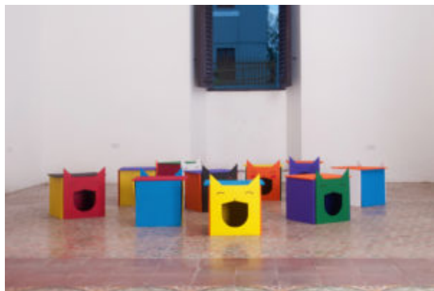
From the series Dollhouses, 2016, toys with geometric forms.

Adriana: Through the space that the toys occupy, and especially with the colored popsicle. Also, in the construction of a soft space. Everything began because next door to the FRAC the neighbors do collective garage sales, assembling big fairs that are called brocante . There the people sell what they don't use anymore. I was looking for clothes