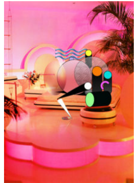
From the series Queer Deco, 2016, print on canvas.