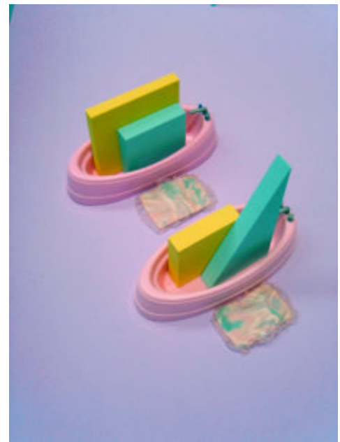
From the series Dollhouses, 2016, toys with geometric forms.

Nicolás: Thinking about the potential for feminisms to push the limits of political imagination, and connecting it to what we talked about in terms of science fiction, the possibility opens to think about the limits of those who occupy the privilege of social intelligibility. But, above all, the visual codes that make those representations of the existent possible: gender and heterosexuality as principles of the possibility of a subject. So the idea to occupy those spaces assigned to human bodies with geometric forms, which are at once intervened with by layers of organic textures, in a sense, invites us to think about the condition of the life of a