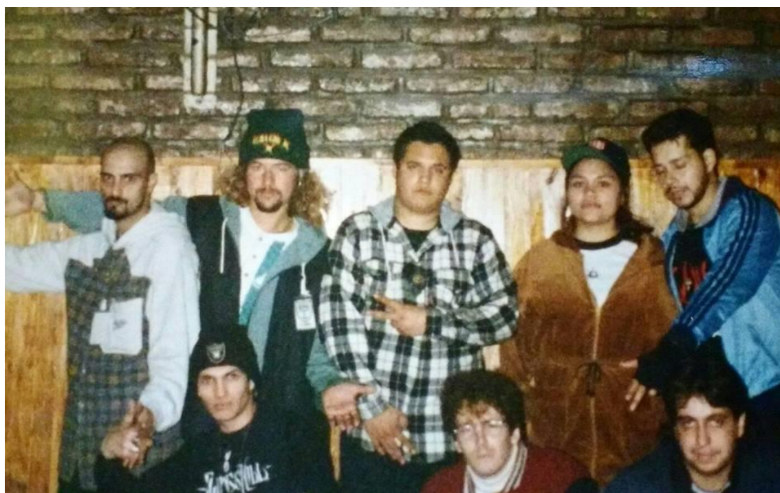
Figure 4: Breakers at an old school premises in the western BA suburb of Villa Madero, La Matanza.

The first experience allowed the emergence of several rappers (and DJs too) who later played a key role in the movement in the following decade.