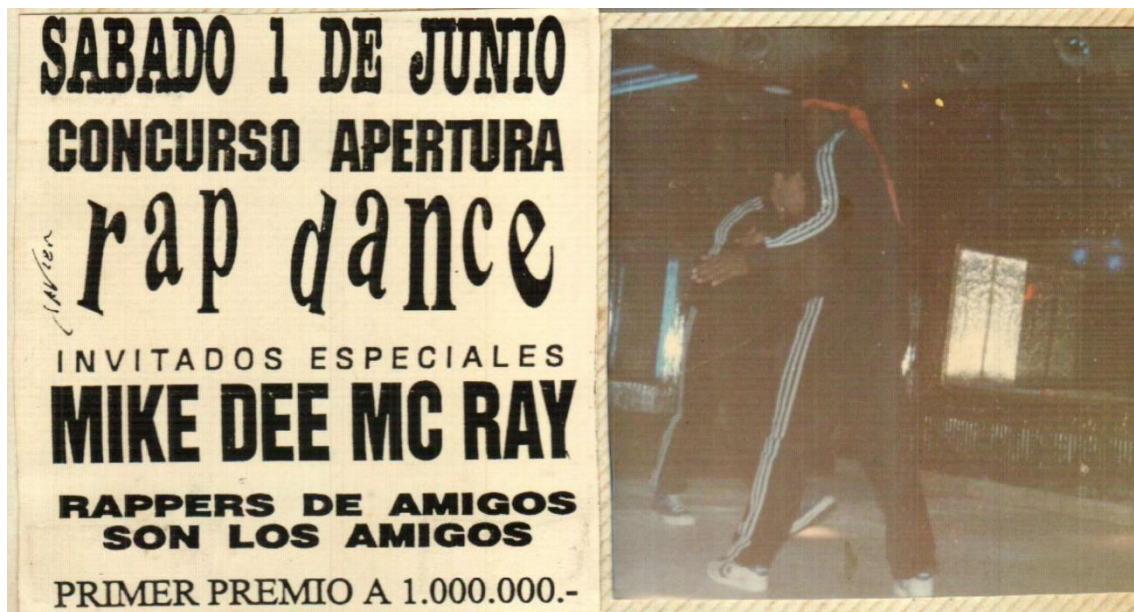
Figure 3: Flyer promoting a rap party at the Pandemonium disco in the western suburb of LaFerrere, La Matanza