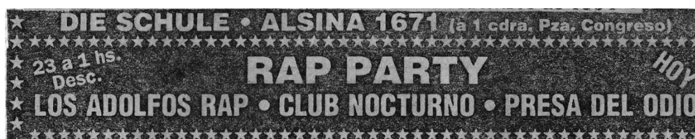
Figure 5: Ad for a rap party on September 27, 1991. (Youth supplement Sí , published by the mass-circulation daily Clarín in Buenos Aires)

of a series of heterogeneous initiatives, which appeared partly thanks to the technological development that made it possible to record tapes for domestic use. (Di Cione, 2012) Musicians were thus able to record tapes with four-channel portable studios and to work independently from big record companies, which were the natural outlet for the development of national rock. (Alabarces et. al., 2008; Pujol, 2006) In this context, many bands, having listened to rap records, adopted the genre and included it in their music production. This was the case with Club Nocturno, Los Adolfos Rap, Presa del Odio, and the Coprófagos Rap, among others (see Figure 5). However, they did not conform a true “local rap scene,” if we are to consider “scene” the networks made up of groups, spaces and audiences sharing the same cultural consumption. The majority of these experiences from the late 1980s continued well into the following decade and found a spot in the “hardcore” music milieu. Although, on some occasions, they shared the stage, they did not form what might be called a local “rap or hip-hop scene,” and they never partook of the music market, bent on national rock, and the only cases of commercial distribution were those of Adolfo Rap and Club Nocturno. Adolfo Rap contributed a song to a rock compilation as a result of a contest organized by a magazine specializing in “rock nacional,” and Club Nocturno managed to put out a record after being selected on a radio show devoted to rock.