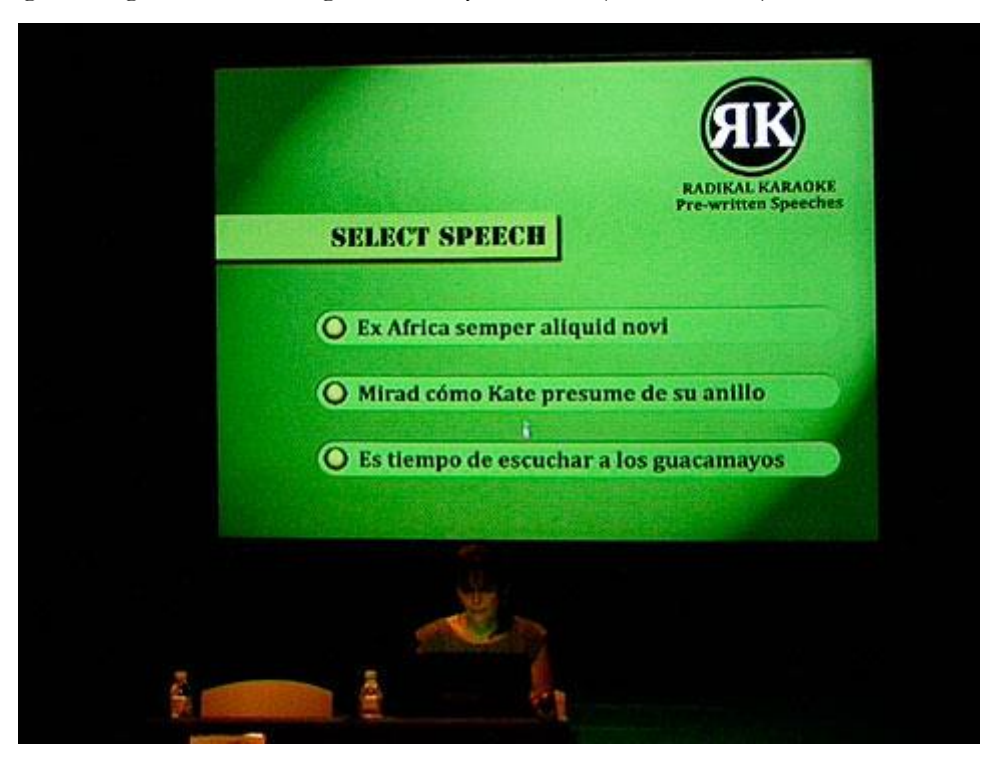
Figure 3: Three speeches to choose in Spanish, in Radikal karaoke by Belen Gache

Reshaping the textual past through a postmodern parody (Hutcheon, 1988), which entails an ironic rupture with the conscience of that past, Gache proposes three transcriptions -in Spanish [figure 3] or in English- we could perform to shake off drowsiness: SPEECH 1 "We are the charming gardeners" (in English); "Ex Africa semper aliquid novi" (in Spanish). SPEECH 2: "Things that you will never see in Australia" (in English); "Mirad cómo Kate presume de su anillo" (in Spanish). SPEECH 3: "We have no past, you have no present" (in English); "Es tiempo de escuchar a los guacamayos" (in Spanish). With these speeches Gache's work searches to denaturalize clichés and stereotyped phrases that circulate as meaningless slogans, while being uncritically received (Gache, 2014).