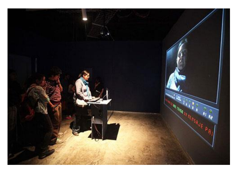
Figure 2: A user performing Radikal Karaoke

Based on this reproduction device, Gache offers a Derridean idea: to reach the difference ( la différance ) in the repetition of texts -songs, discourses, poems. The fact that the author chooses to use a "k" in 'radikal' -instead of following the regular spelling "radical" with a "c"- could be related to the double "k" of karaoke, which seems the most visible cause for this choice. But also, this device of repetition always has moments of discourse deviation that are very productive in their excess, as we could see with the "a" introduced by Derrida (1967) difference / différance.