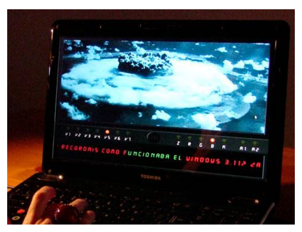
Figure 4: Images of explosions while performing the work Radikal karaoke by Belén Gache

Traditions, conquests, revolutions: the active voice of people who play karaoke is the way to express a criticism of emptiness. The work welcomes the performance of those who -being fragile in their monoligualism- come as guests to the locus of politics. And although this is just a game -just a discourse and then it is over-, this language is hospitable to the other (Derrida 1996), making way for critical thinking regarding the lack of sense shown by politics. If we come back to the Japanese meaning of karaoke we will find, once again, the idea of emptiness in its morphemes: kara (empty), oke (orchestra). Gache seems to return to these etymological meaning to revert it, wondering why words do not matter. And in addition, Gache presents the music as a body that could be used as a partiture that gave ideal-universal instructions to an orchestra but played each time in a different way (Gache, 2014). What she tries to develop is certain consciousness about what we listen to and what we could say when we change back these stereotypes.