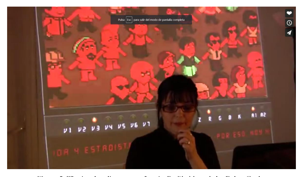
Figure 5: The insubordinate use of art in Radikal karaoke by Belen Gache

Firstly, what contemporary art can achieve is a reversion of the unidirectional movement of the political discourses that dominated the way of making politics in the 20th century i.e., a leader appealing to the masses through the new technologies of the time -radio and television-. Now, that multitude uses the technical possibilities in the opposite way: it demands from politicians through an insubordinate use of art (Brea, 2002).